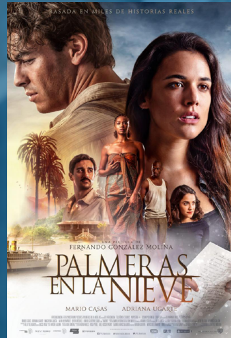
Palmeras en la nieve (2015)