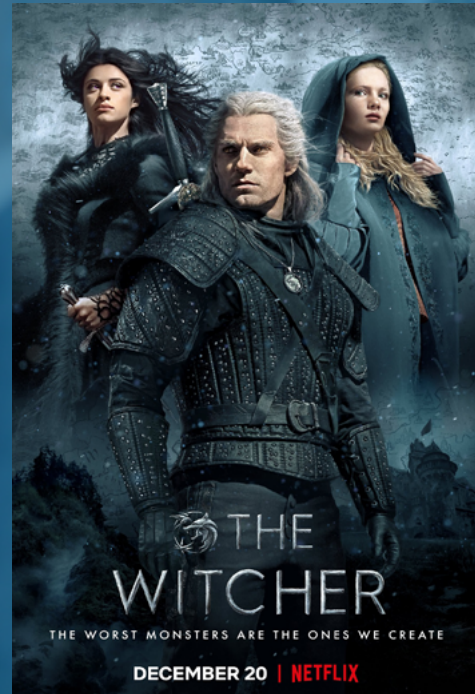
The Witcher (2019)