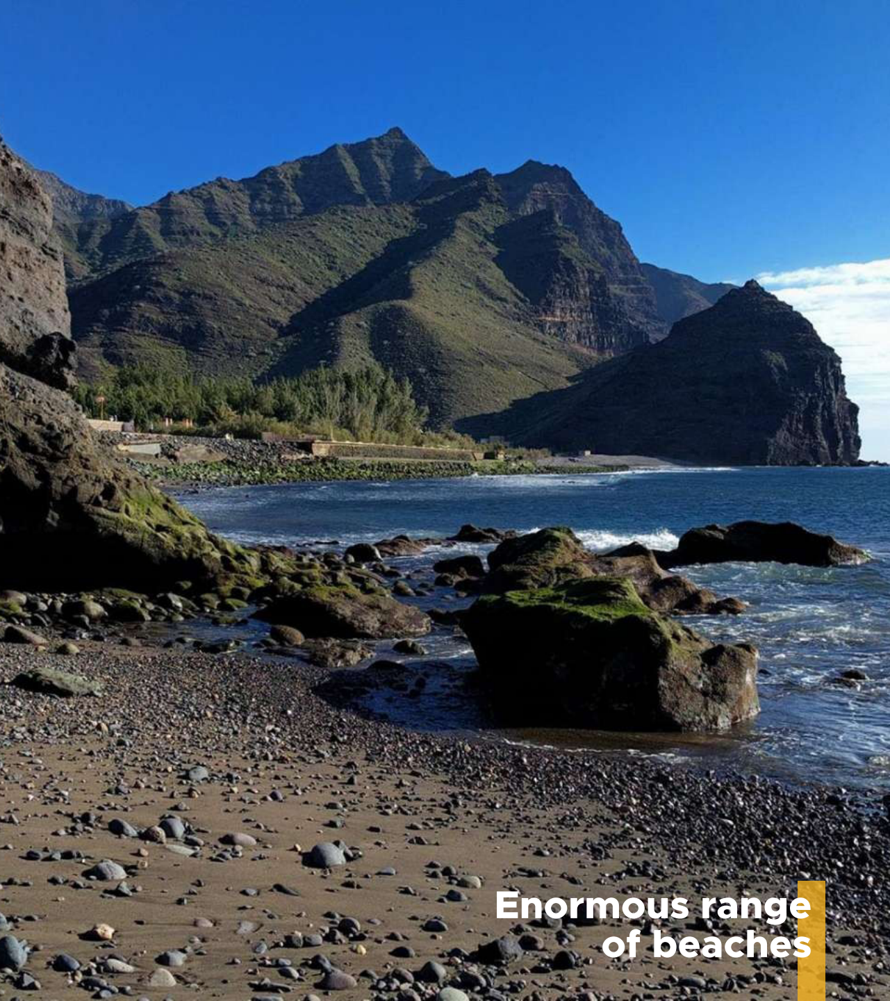
Enormous range of beaches