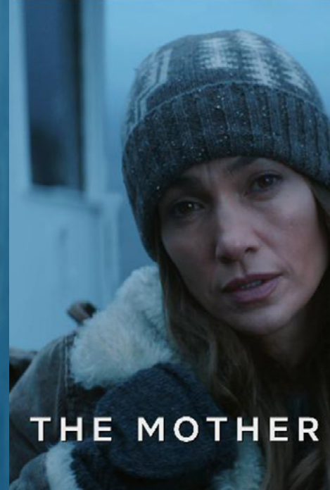
The Mother (2023)