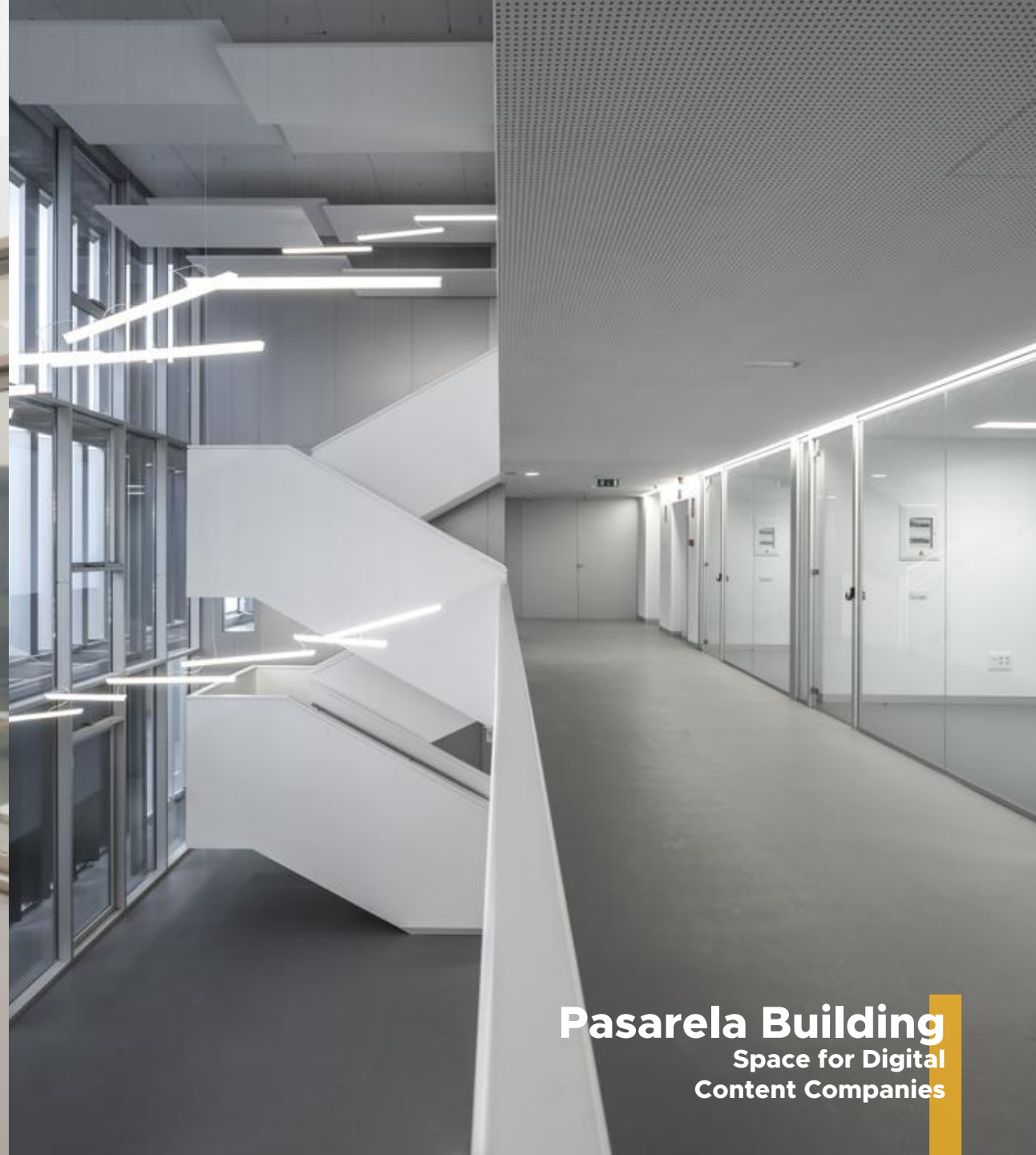
Pasarela Building Space for Digital Content Companies