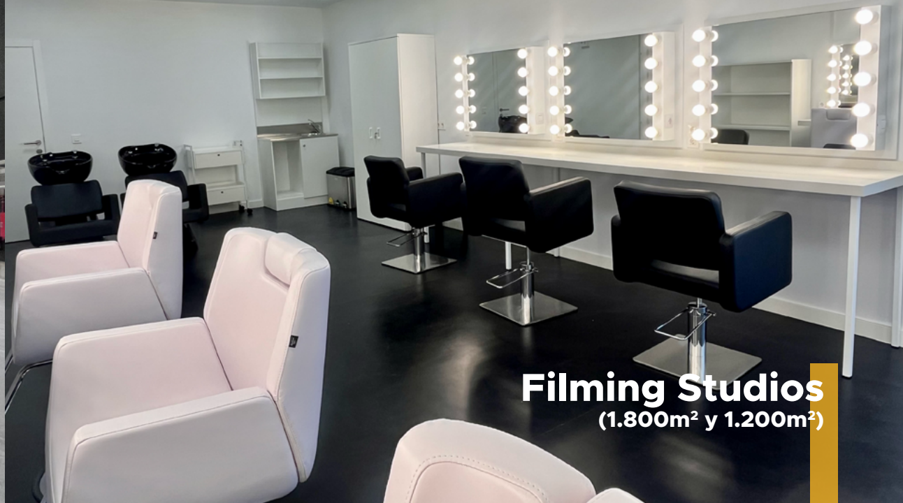
Filming Studios (1.800m 2 y 1.200m 2 )