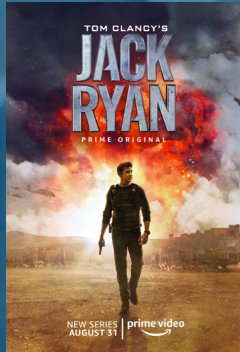
Jack Ryan (2022)