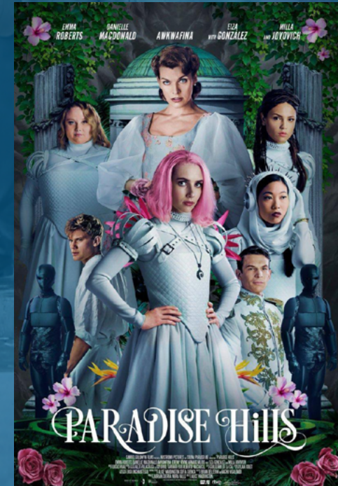
Paradise Hills (2019)