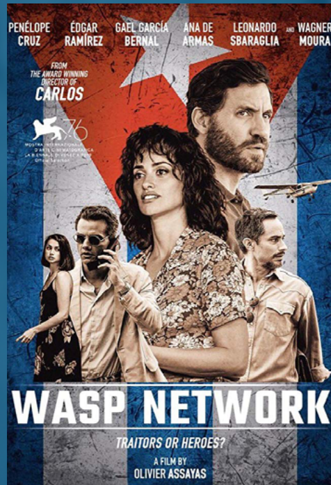
Red Avispa (2019)