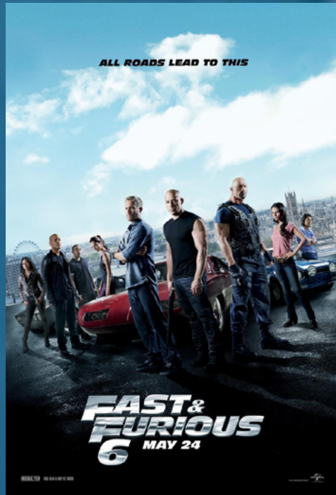
Fast & Furious 6 (2013)