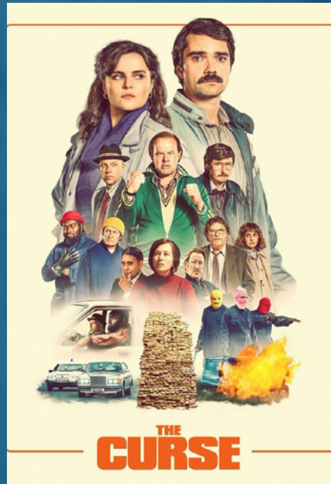
The Curse (2022)