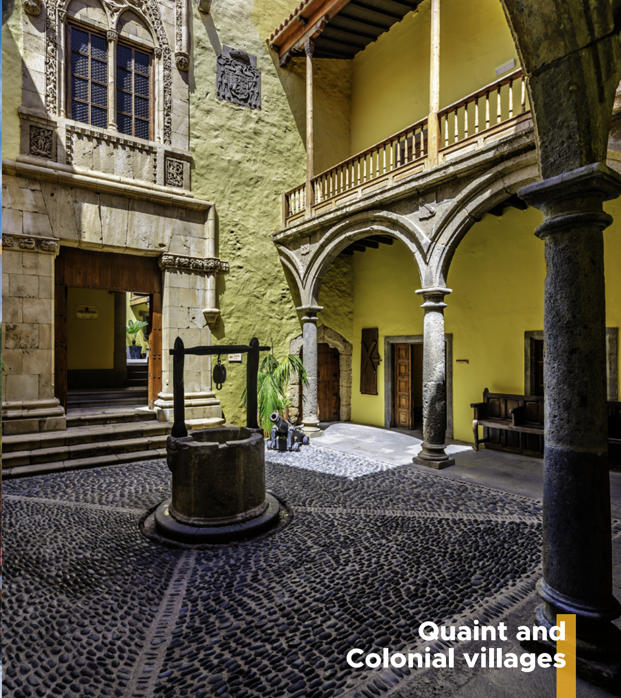
Quaint and Colonial villages